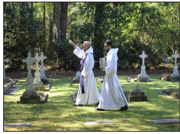
Every November the monks bless the cemetery on All Souls' Day.

9 5/8 inches high, 8 1/4 inches wide, and 6 inches deep.